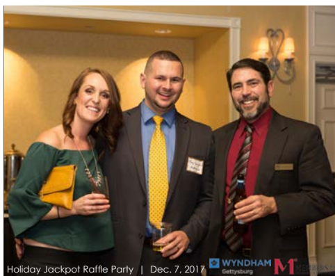
Holiday Jackpot Raffle Party | Dec. 7, 2017 | WYNDHAM Gettysburg MEMBERS