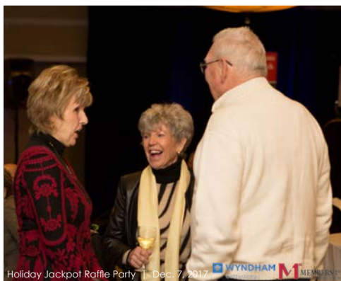
Holiday Jackpot Raffle Party | Dec. 7, 2017 | WYNDHAM Gettysburg MEMBERS