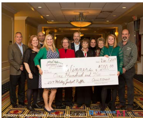
Holiday Jackpot Raffle Party | Dec. 7, 2017 | WYNDHAM Gettysburg MEMBERS