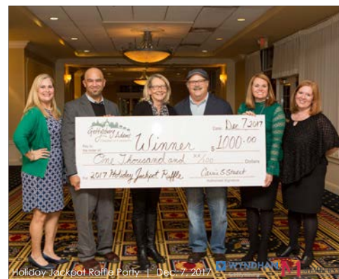
Holiday Jackpot Raffle Party | Dec. 7, 2017 | WYNDHAM Gettysburg MEMBERS