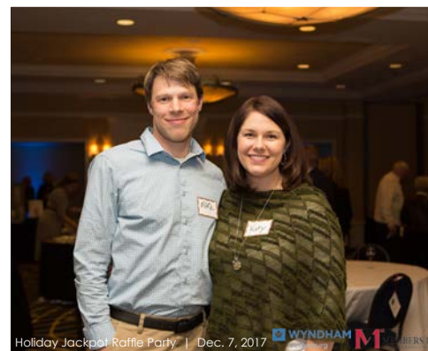
Holiday Jackpot Raffle Party | Dec. 7, 2017 | WYNDHAM Gettysburg MEMBERS