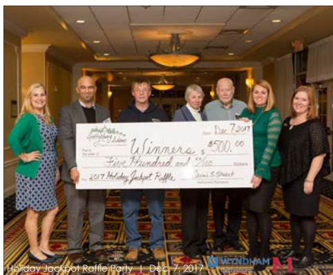
Holiday Jackpot Raffle Party | Dec. 7, 2017 | WYNDHAM Gettysburg MEMBERS