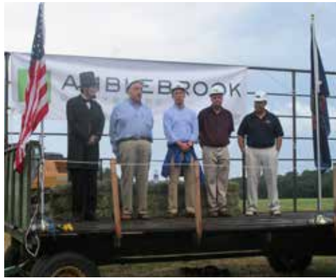
Groundbreaking | July 17 Amblebrook