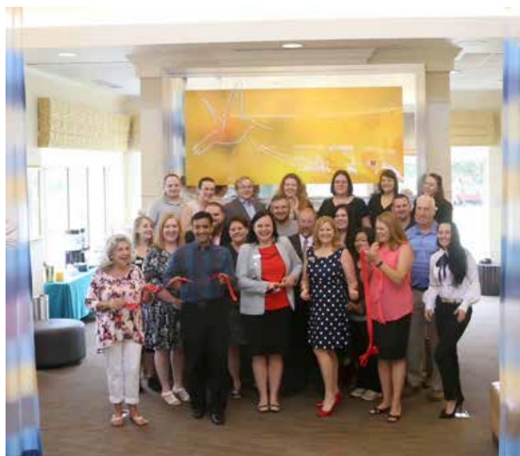
Ribbon Cutting July 25 | Hilton Garden Inn