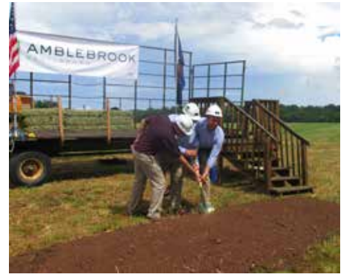
Groundbreaking | July 17 Amblebrook