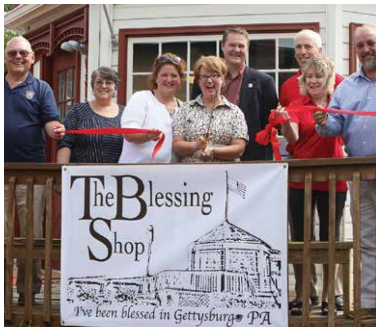
Ribbon Cutting July 6 | The Blessing Shop