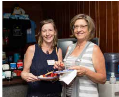
Membership Mixer | July 19 Gettysburg Community Theatre