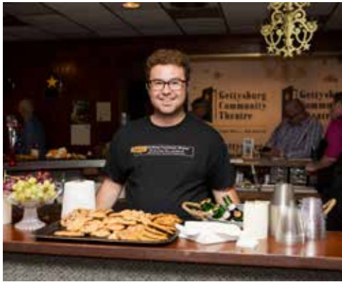
Membership Mixer | July 19 Gettysburg Community Theatre