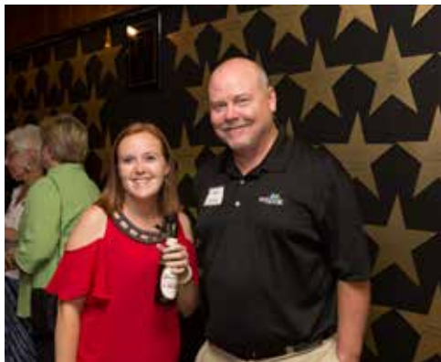
Membership Mixer | July 19 Gettysburg Community Theatre