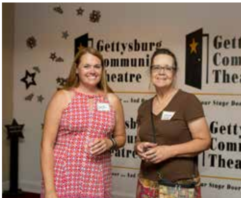
Membership Mixer | July 19 Gettysburg Community Theatre