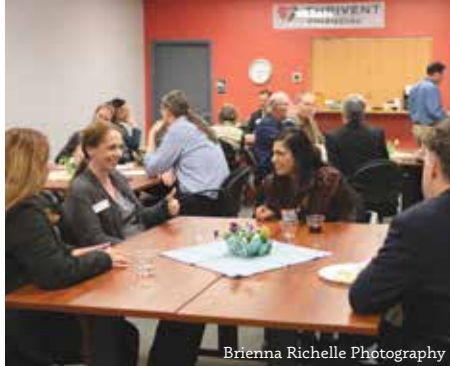
Membership Mixer March 21 | Thrivent Financial