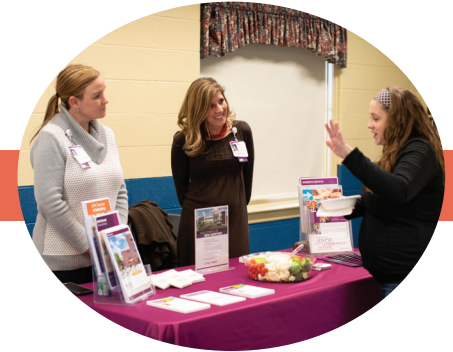
Membership Mixer February 20 Non-Profit Spotlight at GARA