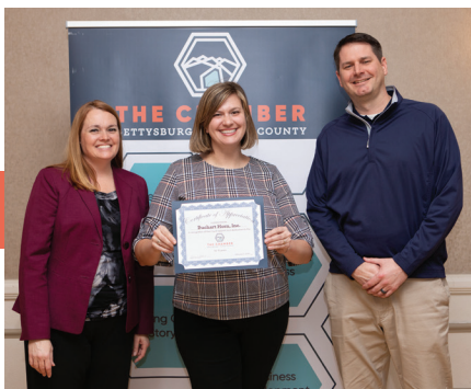
County Connections Luncheon | February 5 Buechart Horn, Inc. 15 years