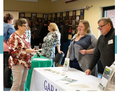
Membership Mixer February 20 Non-Profit Spotlight at GARA