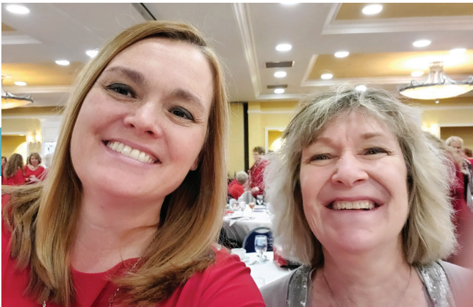
American Heart Association GoRed For Women Luncheon February 21