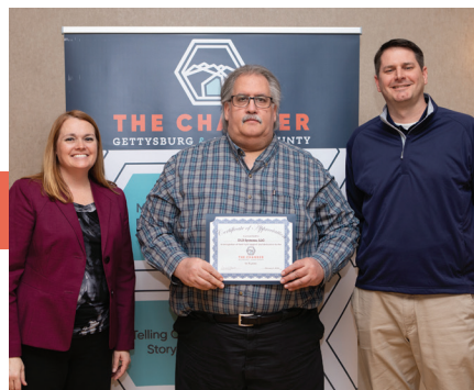
County Connections Luncheon | February 5 DL3 Systems, LLC 15 years