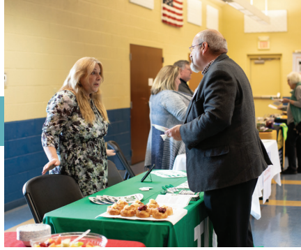
Membership Mixer February 20 Non-Profit Spotlight at GARA