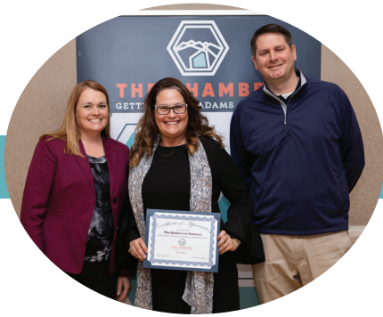
County Connections Luncheon | February 5 The Markets at Hanover 5 years