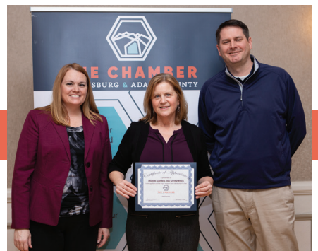
County Connections Luncheon | February 5 Hilton Garden Inn-Gettysburg 15 years