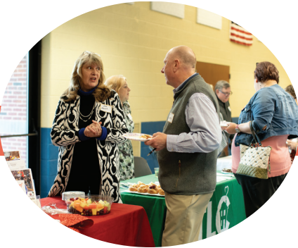
Membership Mixer February 20 Non-Profit Spotlight at GARA