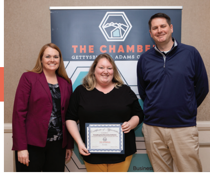
County Connections Luncheon | February 5 Gettysburg Area Recreation Authority 5 years