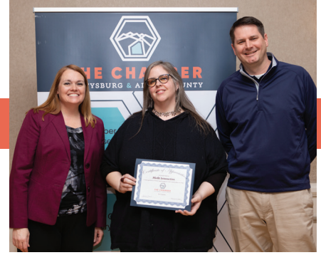
County Connections Luncheon | February 5 Misfit Interactive 5 years