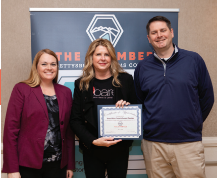
County Connections Luncheon | February 5 bare Skin Care & Laser Center 1 year