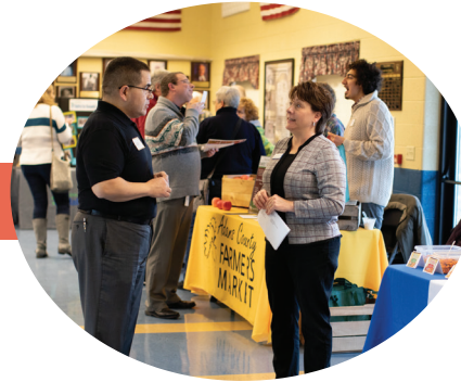
Membership Mixer February 20 Non-Profit Spotlight at GARA