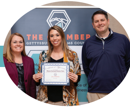
County Connections Luncheon | February 5 Home Instead Senior Care 10 years