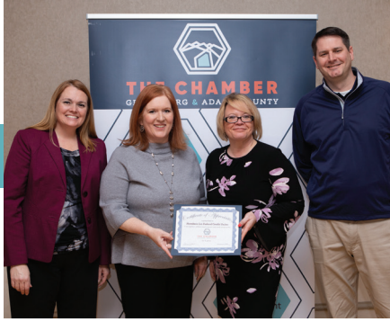
County Connections Luncheon | February 5 Members 1 st Federal Credit Union 15 years