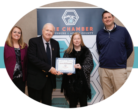
County Connections Luncheon | February 5 Optimist Club of Gettysburg 10 years