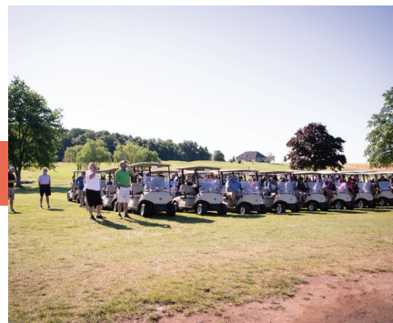
Golf Outing | June 12 Quail Valley Golf Club