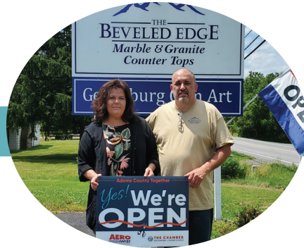
Adams County Open for Business The Beveled Edge Marble and Granite, Inc.