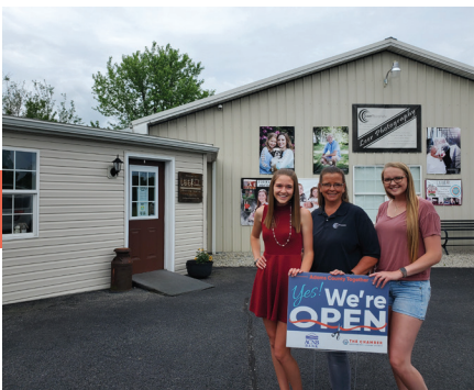
Adams County Open for Business