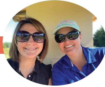
Golf Outing | June 12 Quail Valley Golf Club