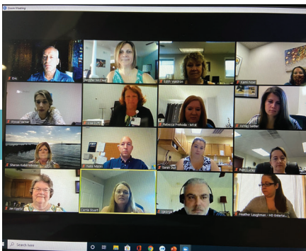
Virtual County Connections June 10