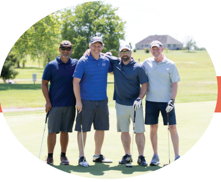
Golf Outing | June 12 Quail Valley Golf Club