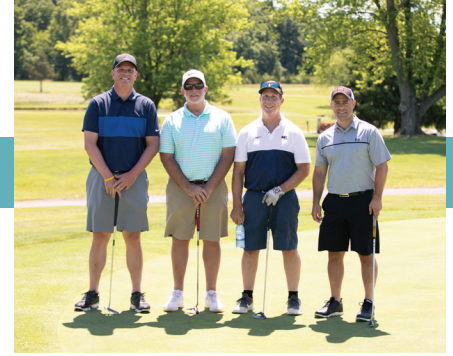
Golf Outing | June 12 Quail Valley Golf Club