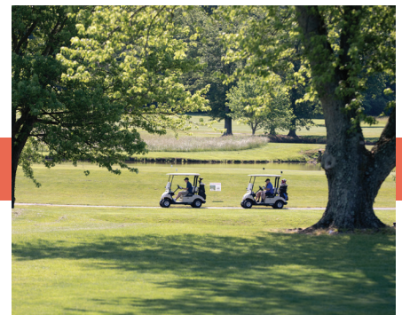
Golf Outing | June 12 Quail Valley Golf Club