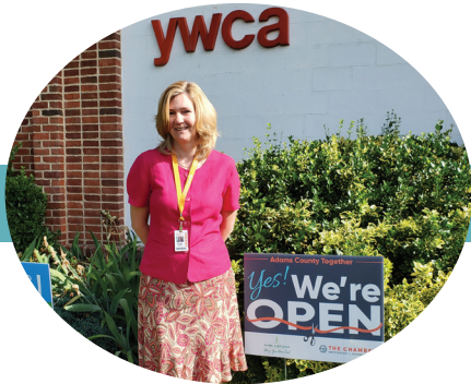
Adams County Open for Business YWCA of Gettysburg/Adams County