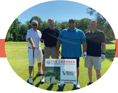
Golf Outing | June 12 Quail Valley Golf Club