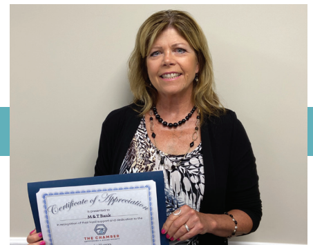
Virtual County Connections June 10 M & T Bank 30 years