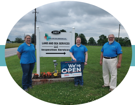
Adams County Open for Business Land and Sea Services LLC