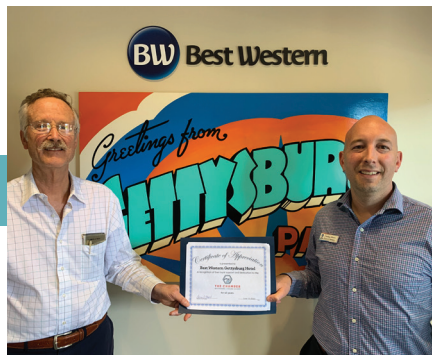
Virtual County Connections June 10 Best Western Gettysburg Hotel 45 years