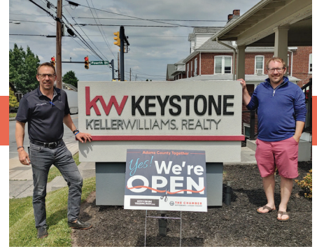
Adams County Open for Business Keller Williams Keystone Realty