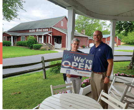
Adams County Open for Business Hickory Bridge Farm