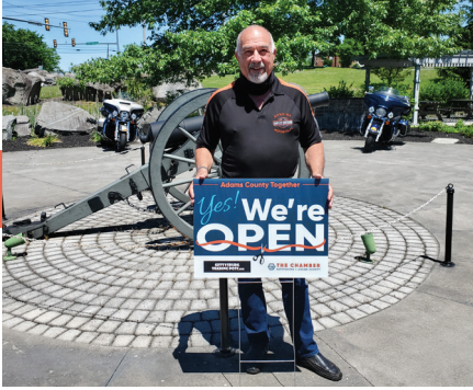
Adams County Open for Business Battlefield Harley-Davidson