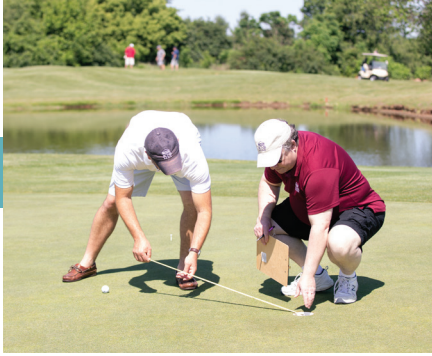
Golf Outing | June 12 Quail Valley Golf Club