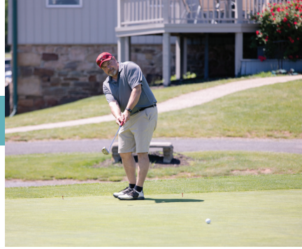
Golf Outing | June 12 Quail Valley Golf Club