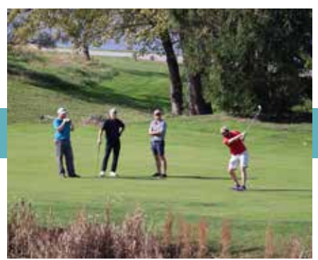
Fall Golf Outing | Nov. 5 The Links at Gettysburg