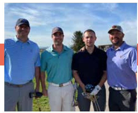
First Place Team Fall Golf Outing | Nov. 5