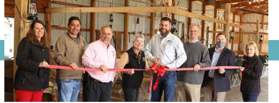
Ribbon Cutting | November 17 The Red Shed at Hickory Bridge Farm