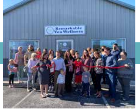
Ribbon Cutting | Nov. 6 Remarkable You Wellness, LLC