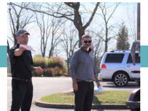
Fall Golf Outing | Nov. 5 The Links at Gettysburg