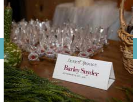
101<sup>st</sup> Annual Meeting | Nov. 12 Inn at Herr Ridge