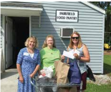
Cash Mob after County Connections Program June 6 | Fairfield Food Pantry