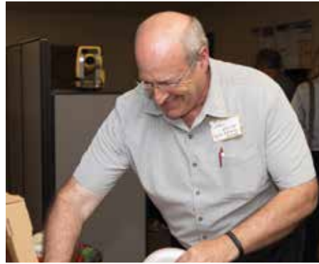
Membership Mixer June 20 | Beyond All Boundaries