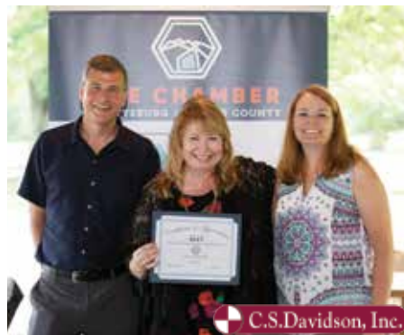
County Connections Program | June 6 BB&T, 20 years