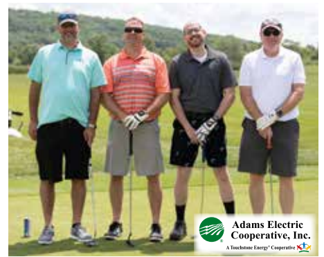
Golf Outing | June 21 1 st Place Team in 3 rd Flight