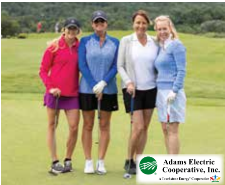
Golf Outing June 21 | The Bridges Golf Club