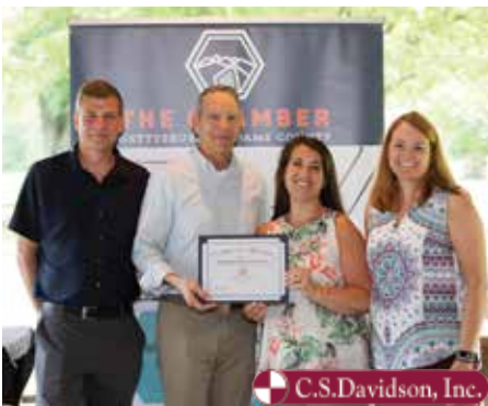
County Connections Program | June 6 Foursquare Church Gettysburg, 10 years