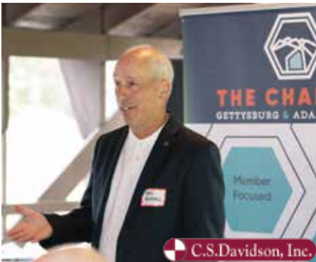
County Connections Program June 6 | Carroll Commons Park