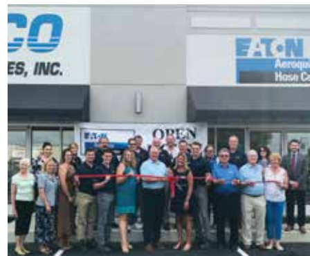
Ribbon Cutting June 19 | Tipco Technologies