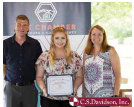
County Connections Program | June 6 Comfort Suites Gettysburg, 10 years