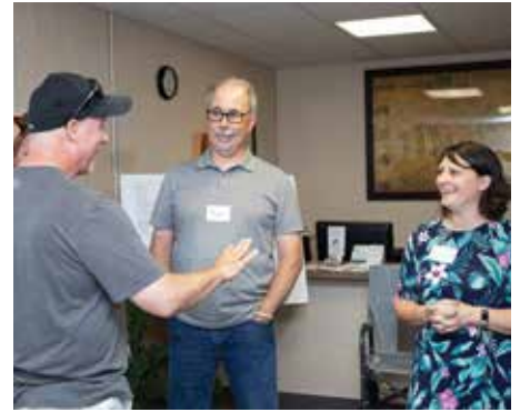
Membership Mixer June 20 | Beyond All Boundaries