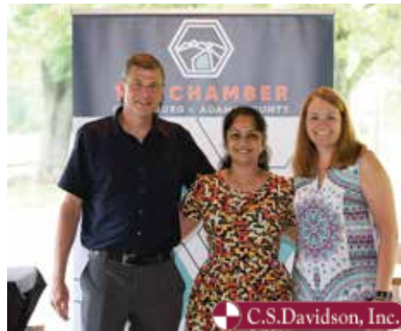
County Connections Program | June 6 Aura Integrative Medicine Clinic, 1 year