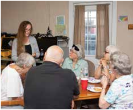
Membership Mixer June 20 | Beyond All Boundaries