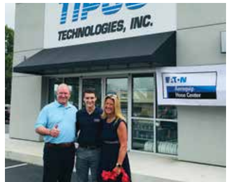
Ribbon Cutting June 19 | Tipco Technologies