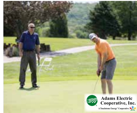
Golf Outing June 21 | The Bridges Golf Club