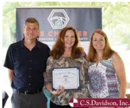
County Connections Program | June 6 AFLAC, 10 years