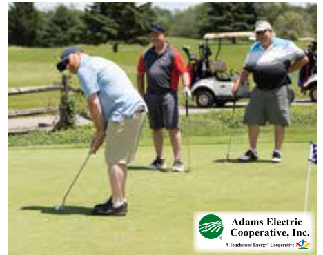
Golf Outing June 21 | The Bridges Golf Club