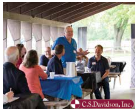
County Connections Program June 6 | Carroll Commons Park