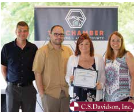
County Connections Program | June 6 Transitions Healthcare Gettysburg, 5 years