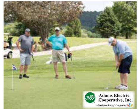
Golf Outing June 21 | The Bridges Golf Club