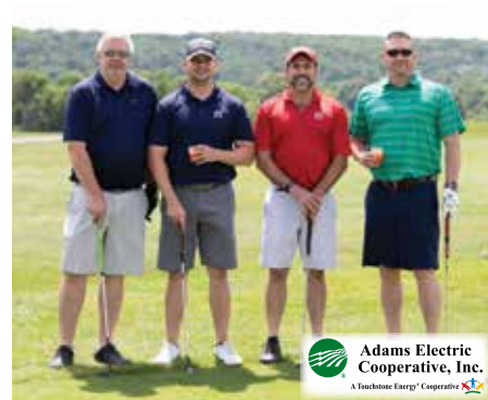
Golf Outing June 21 | The Bridges Golf Club