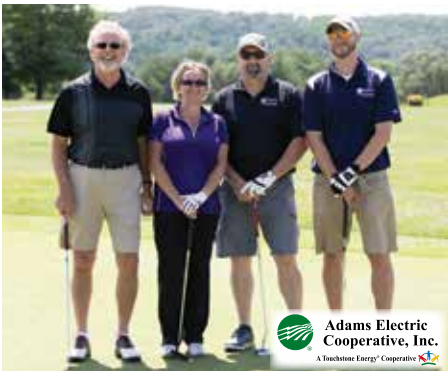
Golf Outing | June 21 1 st Place Team in 1 st Flight