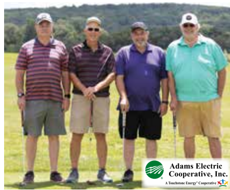
Golf Outing | June 21 1 st Place Team in 2 nd Flight