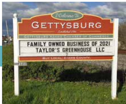
2021 Family Owned Business Taylor's Greenhouse, LLC