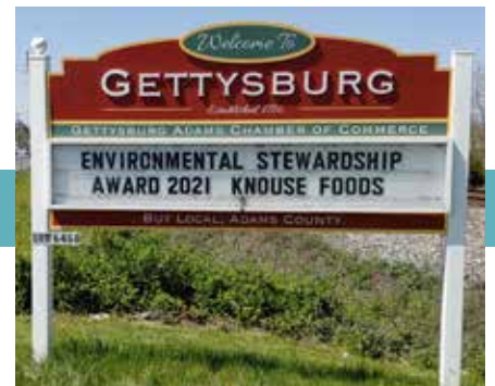
2021 Environmental Stewardship Knouse Foods Cooperative, Inc.