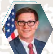
Rep. Torren ECKER