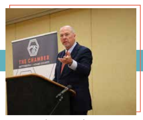
State Legislative Luncheon | May 7 Wyndham Gettysburg