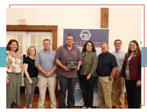
Awards Luncheon | May 18 Taylor's Greenhouse - Family Owned Business of the Year