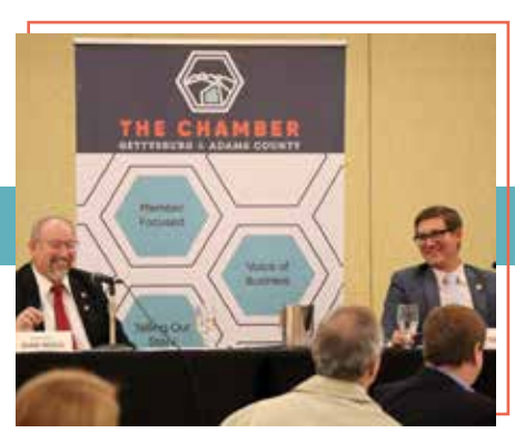
State Legislative Luncheon | May 7 Wyndham Gettysburg