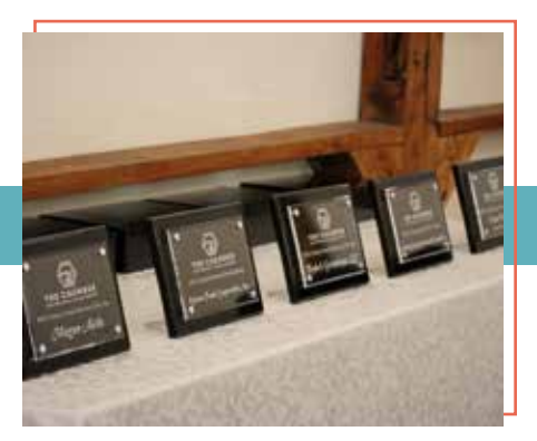
Awards Luncheon | May 18 The Lodges at Gettysburg