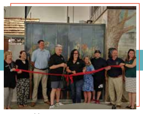
Ribbon Cutting | May 27 The Markets at Hanover