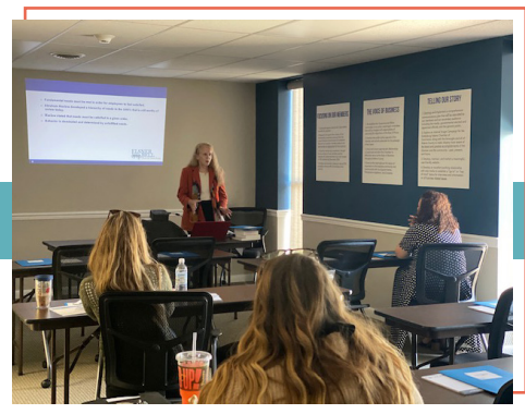
LnL: Employee Retention September 21 Chamber office