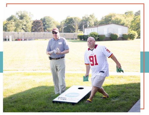
Membership Mixer | September 15 Adams Electric Cooperative, Inc.