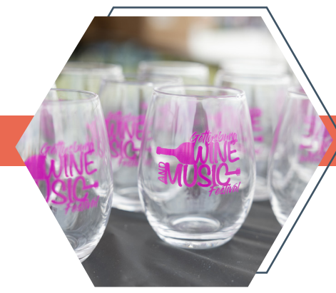
Gettysburg Wine & Music Festival | September 10 & 11 Gateway Gettysburg Complex