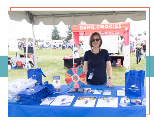
Gettysburg Wine & Music Festival | September 10 & 11 Gateway Gettysburg Complex