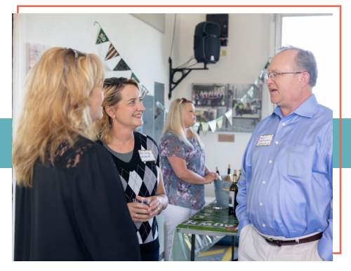
Membership Mixer | September 15 Adams Electric Cooperative, Inc.