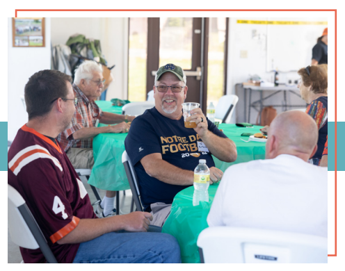
Membership Mixer | September 15 Adams Electric Cooperative, Inc.