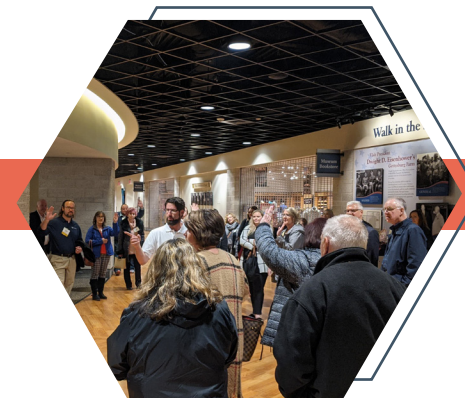
PA Chamber Professionals Conference October 19-21 | Gettysburg Hotel