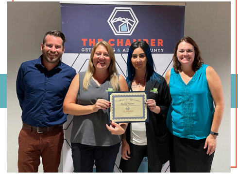
County Connections Prestige Apparel 1 year