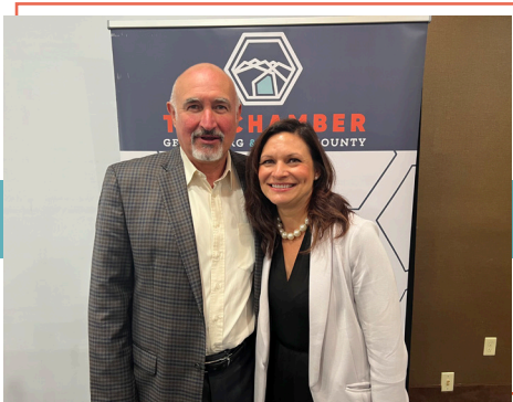
22 nd Adams County Prayer Breakfast October 25, 2022 Comfort Suites