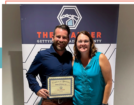
County Connections SMB Associates, Inc. 20 years