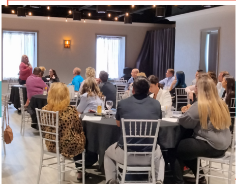
County Connections | October 6 The Markets at Hanover