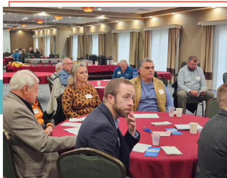
22 nd Adams County Prayer Breakfast October 25, 2022 Comfort Suites