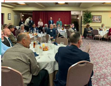
Legislative Reception - Legislative Reception | October 18 The Barn at Herr Ridge