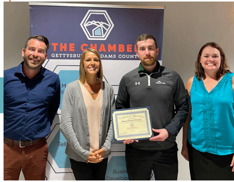
County Connections Drayer Physical Therapy 1 year