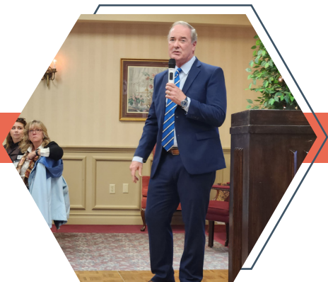
Legislative Reception | October 18 The Barn at Herr Ridge