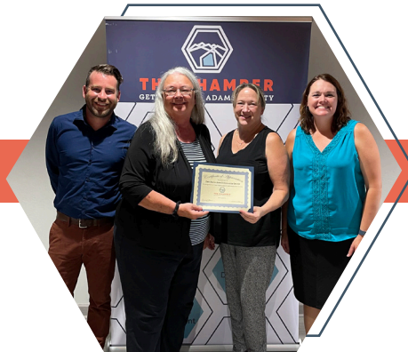
County Connections East Berlin Area Community Center 5 years