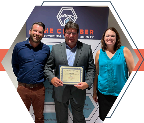
County Connections Proviaus 1 year