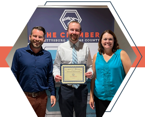
County Connections Barley Snyder Attorneys at Law 5 years