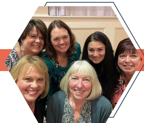
PA Chamber Professionals Conference October 19-21 | Gettysburg Hotel