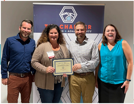
County Connections Everoak Insurance Group 1 year