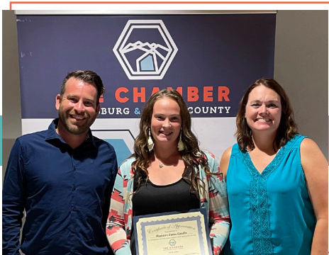
County Connections Horizon Farm Credit 10 years