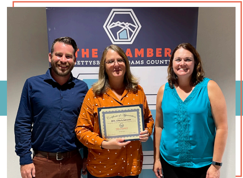
County Connections SEK CPA & Advisors 20 years