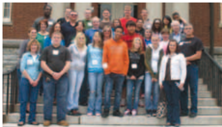
The mentors and mentees at the NETC campus.

A new year of the Mentor Program is off to a great start! This year juniors from Bermudian Springs High School were welcomed into the program, which serves students from Fairfield Area High School, Gettysburg High School and New Oxford High School . The students are enrolled in the program for two years, starting in their junior year, with the expectation that they will build their relationship until the students graduate. This relationship often proves to be just as beneficial for the mentor as it is for the mentee, in numerous ways.