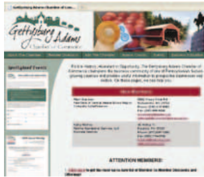
A screenshot of the website showing where to find the most up-to-date discounts.

For those of you that have your cards, we hope that you have distributed them to your employees so they can