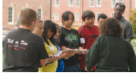
Team building exercises.

and the importance of them in their lives, no matter what their particular experiences have been.