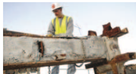
A workman from David H. Martin Excavating, Inc. wraps a chain around the beam before it is offloaded near the construction site at the PSC on Industrial Highway next to the Harrisburg Campus.

The Senator John J. Shumaker Public Safety Center at HACC received a special delivery from the Port Authority of New York: a piece of concrete-encased steel from the Twin Towers at the World Trade Center. The