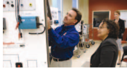
Nancy Sutley, right, President Obama's principal environmental adviser and chair of the White House Council on Environmental Quality, gets a lesson in solar photovoltaic (PV) energy during a visit to HACC's Midtown site on Friday, Sept.

Hoffman Community Room (130) at the campus. Enjoy campus tours and hear what faculty and current students have to say about HACC. An RSVP is encouraged but not required. To register, or for more information, call the Gettysburg Campus at 337.3855, then press 1, or go to www.hacc.edu/Gettysburg .