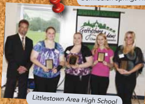
Littlestown Area High School