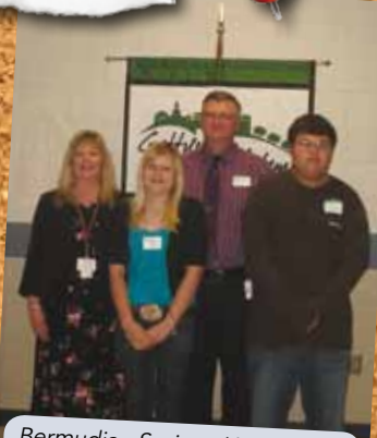
Bermudian Springs High School