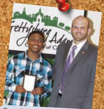
Gettysburg Area High School