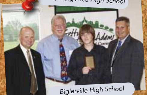
Biglerville High School