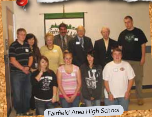
Fairfield Area High School