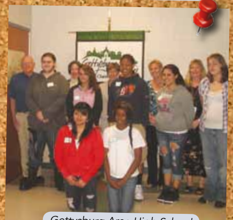
Gettysburg Area High School