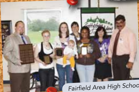
Fairfield Area High School