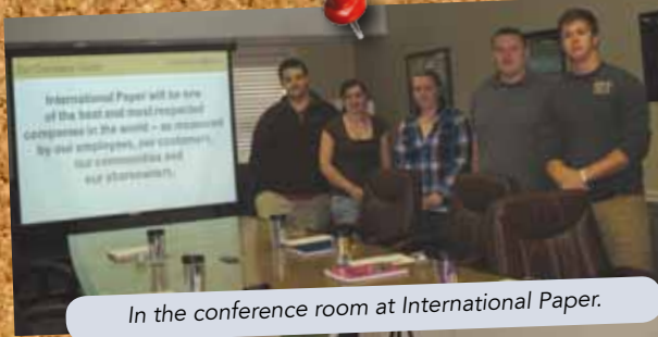
In the conference room at International Paper.