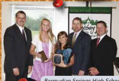
Bermudian Springs High School