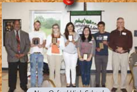
New Oxford High School