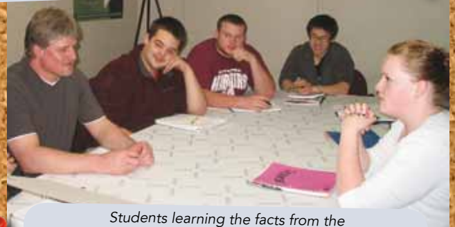
Students learning the facts from the management team of Graphcom.