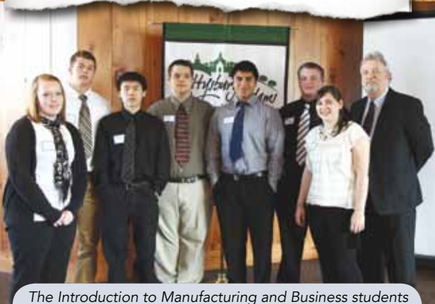
The Introduction to Manufacturing and Business students at the General Membership Breakfast on May 16.