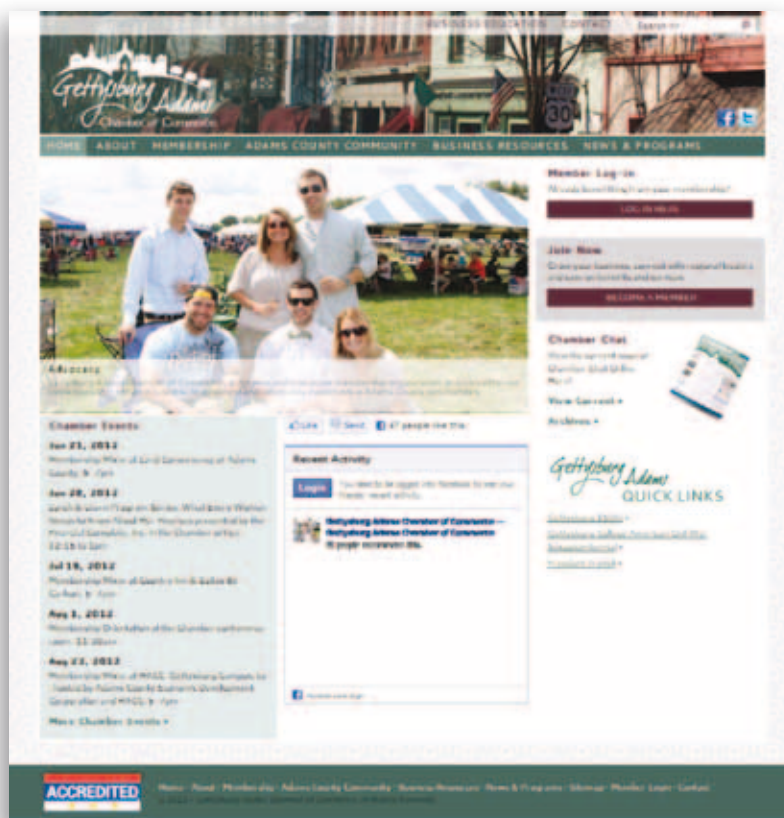
A screenshot of the Chamber's re-designed website.

The Chamber hopes that the changes to the website will be beneficial to all, so check it out!