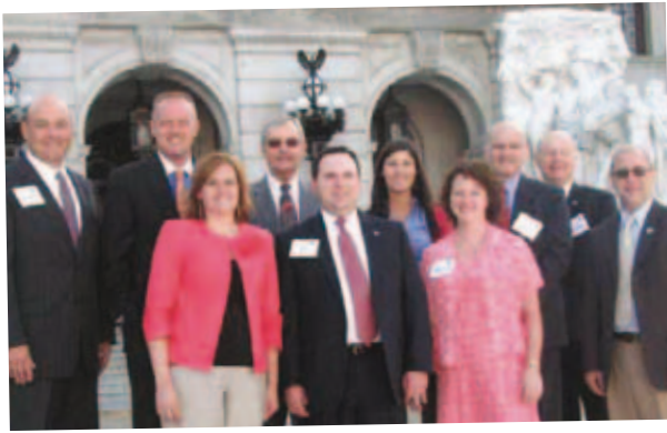
Pictured above: Legislators from York and Adams Counties, Chamber Representatives from the York Economic Alliance, Hanover Area, and Gettysburg Adams Chamber of Commerce on Capitol Hill.

Chamber Day on Capitol Hill was co-hosted last month by the Pennsylvania Association of Chamber Professionals and The Pennsylvania Chamber of Business and Industry. I had the opportunity to attend for my first time. Along with the delegation from the York Economic Alliance (formerly the York County Chamber and York County Economic Development Corporation) and the Hanover Area Chamber, I spent time talking with our legislators