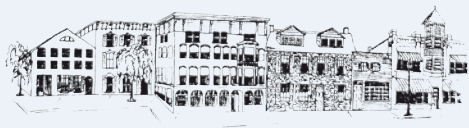
Gettysburg Area Retail Merchants Association