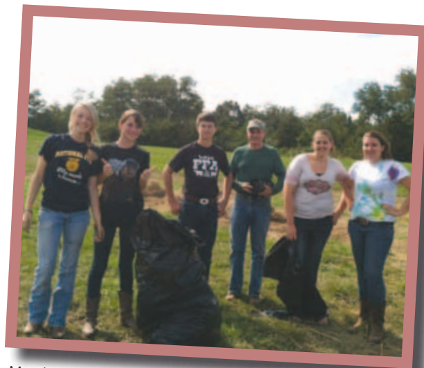
Members of the Gettysburg High School Battlefield FFA, were a huge help as they cleaned up the Festival grounds.

It seems as though the October newsletter always has two things in common, the Gettysburg Wine & Music Festival and the mention of rain! This year a micro-burst (a first experience for many) tore through the grounds on Saturday and wreaked havoc on many of the tents, the fencing and the sound system. The unprecedented storm emergency caused the festival to close early in order to assure the safety of vendors, volunteers and attendees. Fortunately we were able to clean up the storm aftermath and re-open on Sunday.