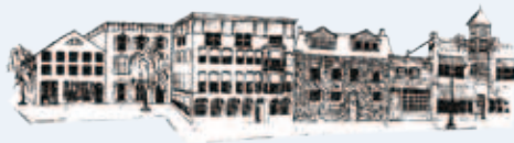
Gettysburg Area Retail Merchants Association