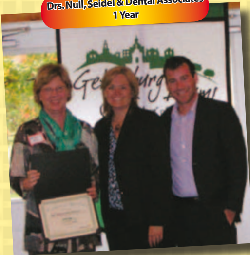
Drs. Null, Seidel & Dental Associates 1 Year