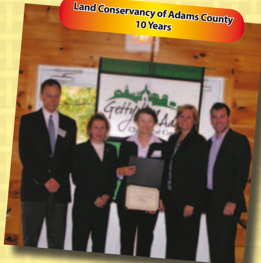
Land Conservancy of Adams County 10 Years