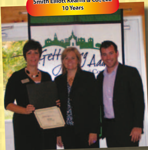
Smith Elliott Kearns & Co., LLC 10 Years