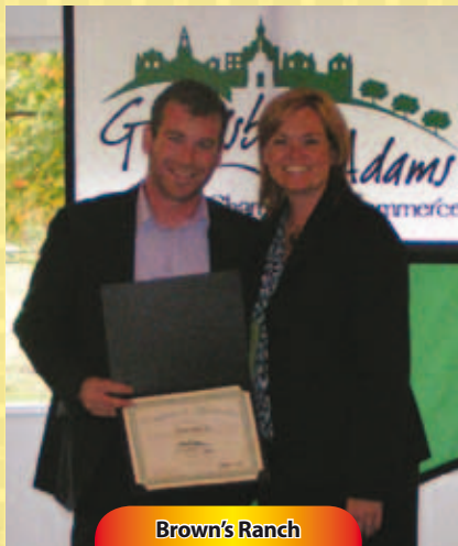
Brown's Ranch 5 Years