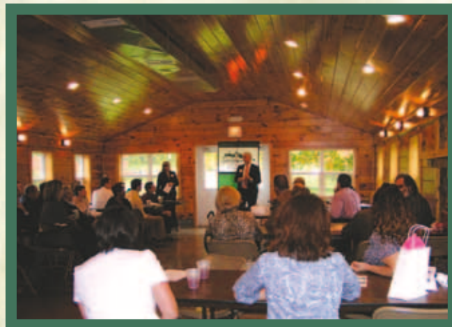
Attendees of the 2 nd County Corners Breakfast, which took place in the Carroll Valley/Fairfield area on October 3.

BEP Mentor Team Meeting, 9am, Chamber office