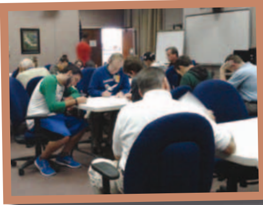
Mentors and Mentees fill out personality profiles for the training event at NETC.

We are off to another great start! The Business Education Partnership's Mentoring Program kick off event was held at the National Emergency Training Center (NETC) in Emmitsburg, Maryland at the end of September.