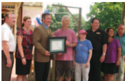
Mr. G's Ice Cream was a previous recipient of the Beautification Award.

Do you know of a business or organization that just completed an extraordinary beautification project, performed a service to the community above and beyond its normal mission, or displayed exemplary customer services? If so, the Business & Industry Team would like to recognize the business with a special award presentation. Contact the Chamber office for a nomination form at 717.334.8151.