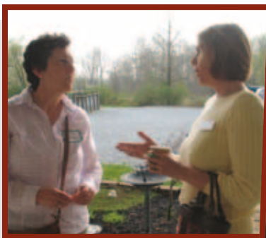
The April Mixer was held at Gettysburg Holistic Health Center.

Please come visit the only animal shelter in Adams County for hot dogs, beer, music, raffle prizes and more! RSVP attendance to the Chamber office by June 18 - 717.334.8151.