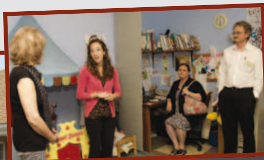
The May Mixer was held at the Children's Aid Society in New Oxford.