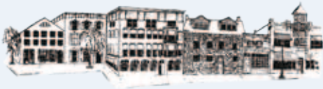
Gettysburg Area Retail Merchants Association