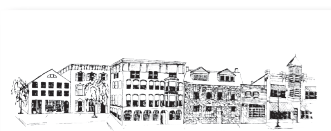
Gettysburg Area Retail Merchants Association