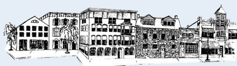
Gettysburg Area Retail Merchants Association