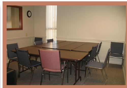
Just down the hall from Carrie's office is the new conference room space for small meetings.