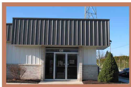
The Chamber's entrance is on the right side of the building - Adams Electric is on the left.

We are extremely excited to share our new home with all of you! Below is a "virtual tour" of our office, but we welcome you to stop out anytime to see it first-hand. An open house will be held in April, in conjunction with celebrating our 95th Anniversary, so keep an eye out for details as they are finalized.