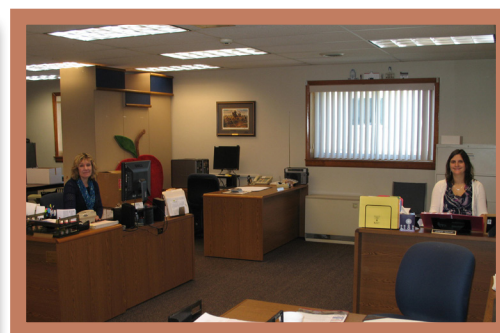
You are greeted by the staff as you walk through the door and they are always eager to help.