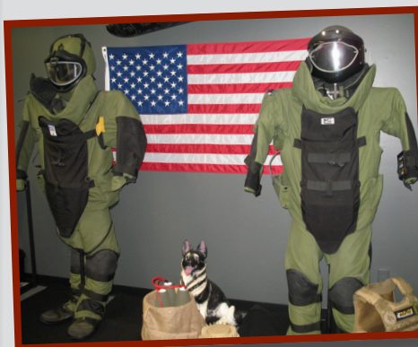
January Mixer hosted by Tripwire Operations Group in Gettysburg

RSVP your attendance to the Chamber office, 717.334.8151, before February 13