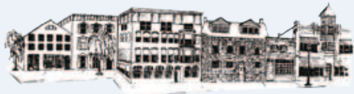
Gettysburg Area Retail Merchants Association