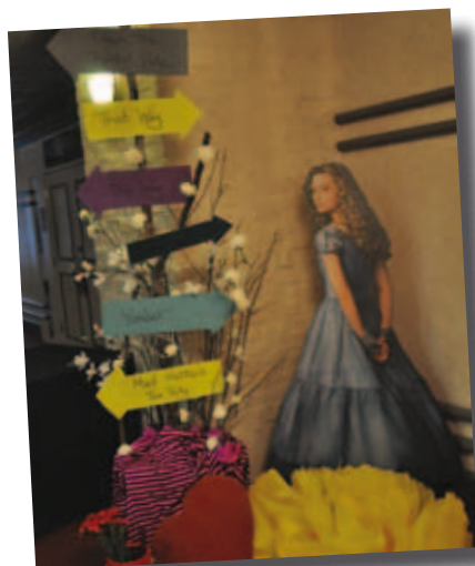
The February Mixer was hosted by the Eisenhower Hotel & Conference Center