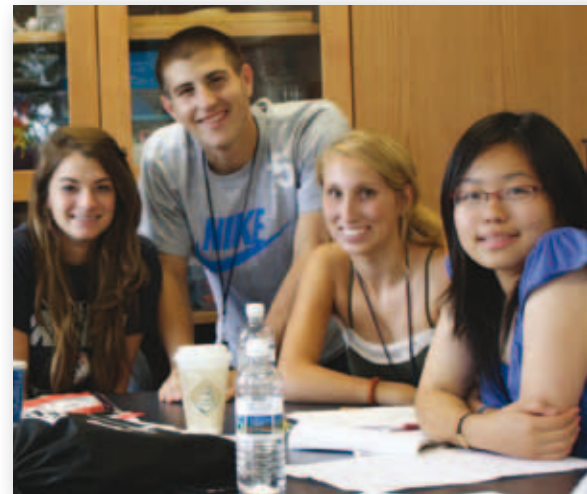
Student "company" members take a short break from their PFEW projects.

Each summer, PFEW holds four, one-week individual sessions in July and August. The focus of the week is to group the participants (strangers at first) into "management teams" of senior executives who have inherited imaginary "companies." These teams, under the guiding hands of "executives-on-loan," called Company Advisors, operate their firms for a computer-simulated three-year period of time. To add a sense of reality, they are competing against two other student "companies" manufacturing and distributing the same product. These fledgling corporate executives are faced with decisions that any real-life business person confronts daily. They work with balance sheets, statements of income, market share surveys, etc., and must also react to a variety of external factors.