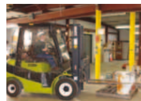
The used transformers being loaded for distribution overseas.

Adams Electric Cooperative, Inc., and Consolidated Electric Co-op, of Mount Gilead, Ohio, together donated nearly 100 used transformers to the NRECA International Foundation to distribute to electric co-ops in the Philippines. The transformers are en route from Adams Electric to a port in Norfolk, VA. From there, they will travel via sea freight to the Philippines, where co-ops will refurbish them before putting them into service. Transformers are good candidates for equipment donations, because of their longevity.