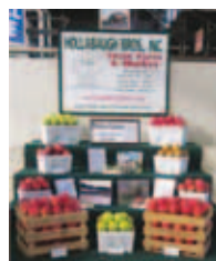
The 2 nd place Farm Show display.

Harrisburg-Hershey, Harrisburg, PA. Representatives from Dell and Cisco Systems, and a Microsoft specialist will present actual case studies. The fee to attend is $60 for PA Chamber members, $85 for non-members. For your convenience, you may register online at www.pachamber.org/conf or call our toll-free Conference Hotline 877.866.8965.