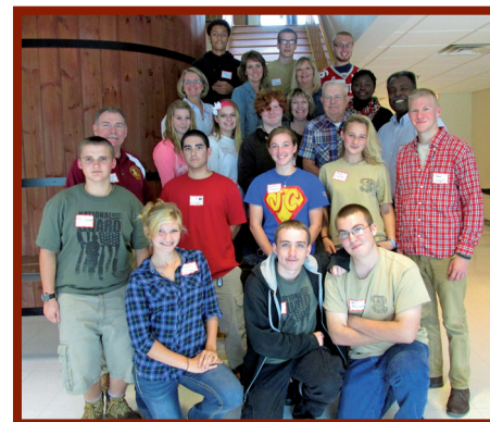
The 2014 Mentor Program kicked off last month during a day-long retreat at the Adams County Agricultural and Natural Resource Center in Gettysburg.

Mentors are charged with building a consistent and reliable relationship with the students, many of whom have never experienced a similar interaction with an adult. Mentors connect with their mentees once a week by phone or email and meet face-to-face monthly. They work with their mentees on goal setting, occupation selection, giving and receiving criticism, money management and time management – basic life and work skills.