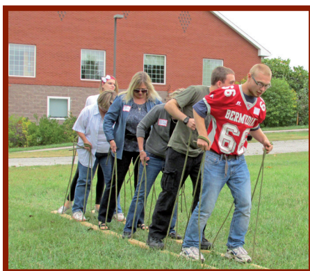
A team building exercise during the Mentor Program retreat.