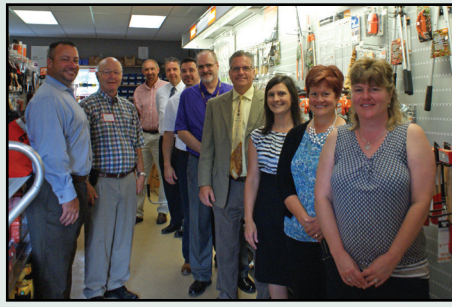
CASH MOB at Adams County Surplus and Building Supply