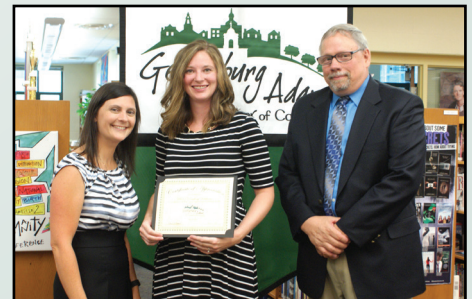
PSI Pumping Solutions, York Springs, 1 year