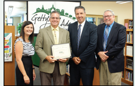
Wyndham Gettysburg, Gettysburg, 10 years