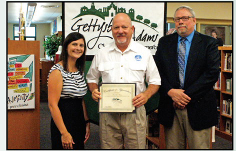
NicMar Water, York Springs, 15 years