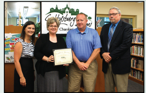
Creative Gatherings, Gettysburg, 1 year