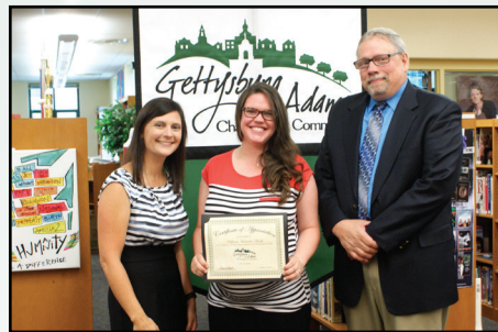
Hoffman Homes for Youth, Littlestown, 15 years