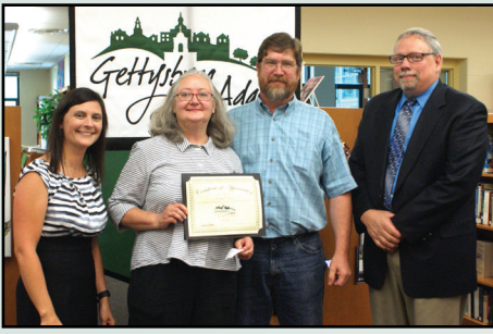
Redbud House, New Oxford, 1 year