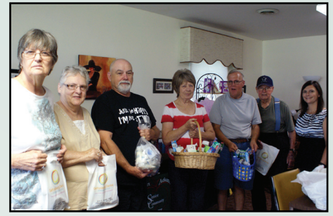
Chamber members donated toiletries to the Upper Adams Senior Center for distribution to local victims of disaster.