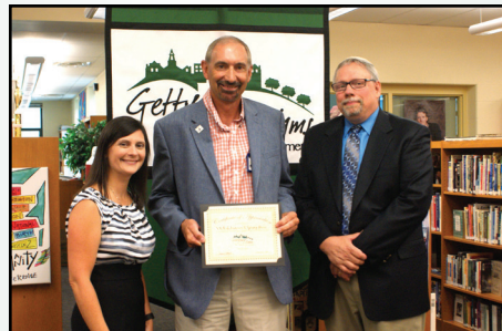
VNA of Hanover & Spring Grove, Hanover, 15 years