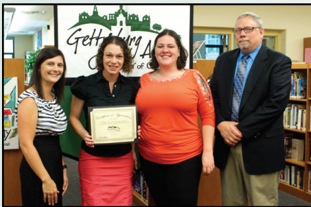
Country Inn & Suites by Carlson, Gettysburg, 15 years