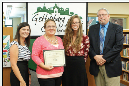
Gettysburg Dental Associates, Gettysburg, 5 years