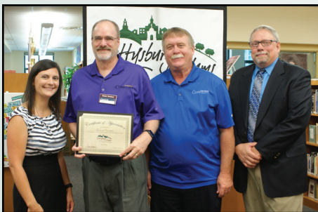
Financial Consulate, Gettysburg, 5 years