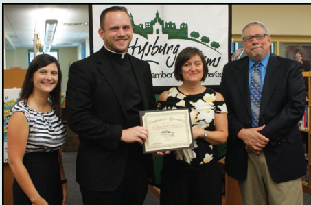
St. Francis Xavier Catholic School, Gettysburg, 15 years