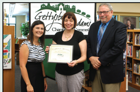
Oasis Television Productions, Gettysburg, 1 year