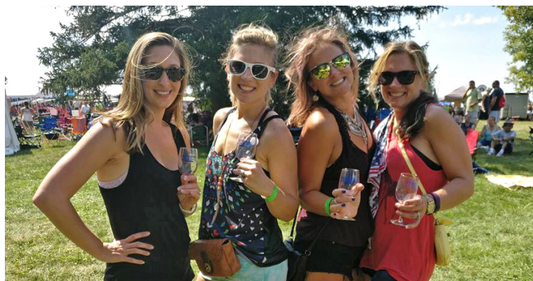
Attendees enjoy the Gettysburg Wine & Music Festival