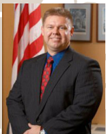
Sen. Rich ALLOWAY