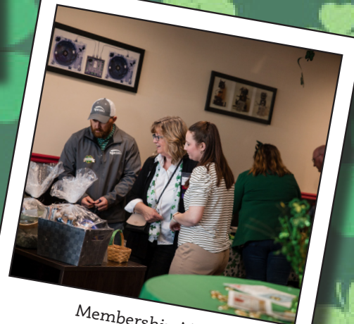
Membership Mixer March 13 iNet Technology Group