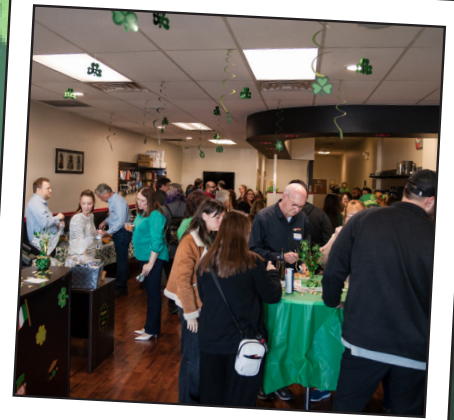
Membership Mixer March 13 iNet Technology Group