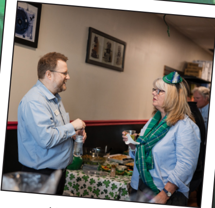
Membership Mixer March 13 iNet Technology Group