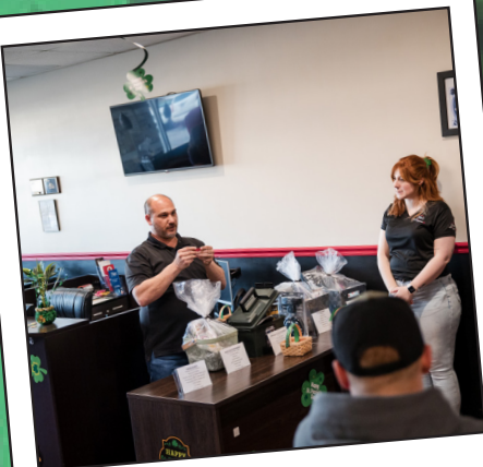
Membership Mixer March 13 iNet Technology Group