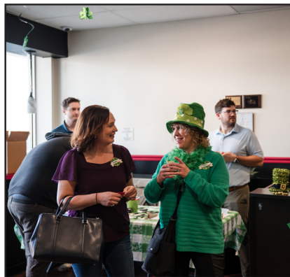
Membership Mixer March 13 iNet Technology Group