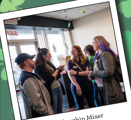
Membership Mixer March 13 iNet Technology Group