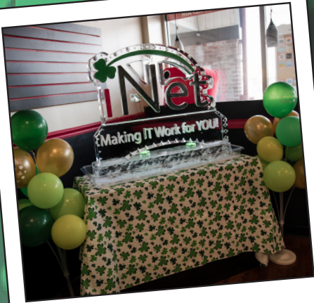
Membership Mixer March 13 iNet Technology Group