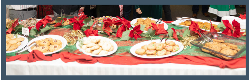
Table Sponsor - $200